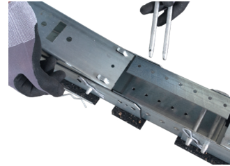
Connector sets with pin system