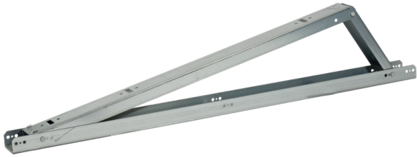
Elevation with protection mat with/without alu-triplexfoil

A high degree of pre-assembly guarantees safe, simple and largely tool-free installation, as well as very short installation times and costs.