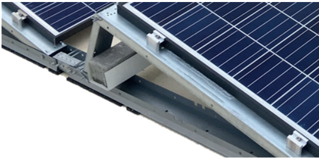
Module fixing: middle clamp-set + compensation profile Ballasting: ballast hub with stones